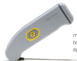
mobile temperature application