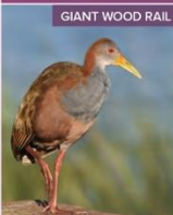
GIANT WOOD RAIL

New animals are joining us to be a part of Amazon River's Edge. Ryder the handsome howler monkey has arrived from Roger Williams Park Zoo. The colorful toucans, Cayenne and Mango, joined our flock along with Tilly, Bell, Poblano, and Habanero- the dashing Inca Terns. Joining them in the soon-to-be-complete Amazon Immersion aviary are Smores and Cocoa, the Peruvian Thick-knees, Coconut and Lime, the Giant Wood Rails, and Houdini, the Black Spotted Barbet. We are honored to have such richness join our family and we will be warmly welcoming many more delightful personalities in the months to come.