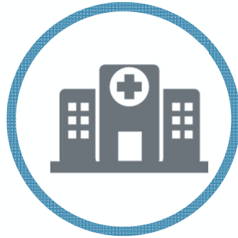
Community & Doctor Owned Hospitals