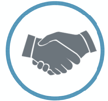
Professional Liability Carriers