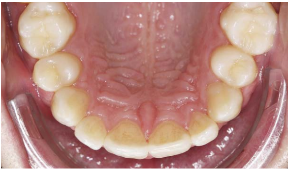
Figure 5: The maxillary occlusal view (1:2) evaluates and confirms accurate replication of secondary anatomy and embrasure contours.

When restoring central incisors, one must pay careful attention to achieve near perfect symmetry in the contours and optical qualities of the adjacent central incisor as well as in the surrounding dentition.