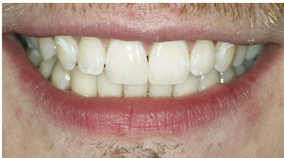
Figure 8: Postoperative natural smile; frontal view (1:2). The final restorations blend seamlessly with the adjacent dentition. The light reflection shows symmetrical contours and line angles