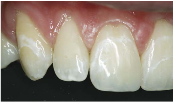
Figure 4: Postoperative retracted right lateral view (1:1). A milky-white microhybrid composite is ideal for recreating the incisal halo due to its opacity and increased edge strength.