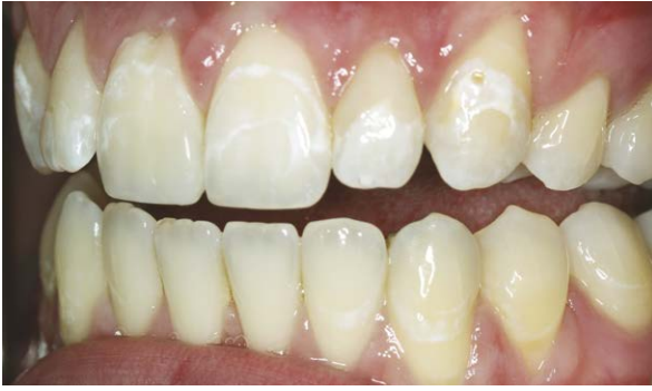
Figure 3: The postoperative retracted left lateral view (1:2) shows the recreation of the incisal halo, which blends seamlessly into the intact tooth structure on the central incisors.