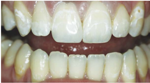
Figure 7: Postoperative retracted frontal view (1:2). The mamelon placement and facial contours were not symmetrical in the evaluation of the first composite restoration of #8, and the decision was made to remove and relayer some of the facial composite to perfect the esthetics.