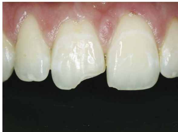
Figure 1: The preoperative retracted anterior view (1:1) shows the incisal corner fractures of #8 and #9.

Mock-up and preparation: Anesthesia was accomplished with 1.7 mL of 4% Septocaine 1:100,000 (Septodont; Louisville, CO) above the apices of