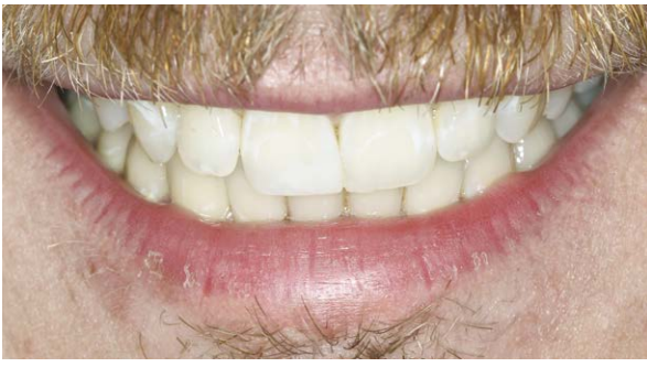
Figure 6: Postoperative smile, frontal view (1:2); the opacity was too noticeable and unnatural looking.