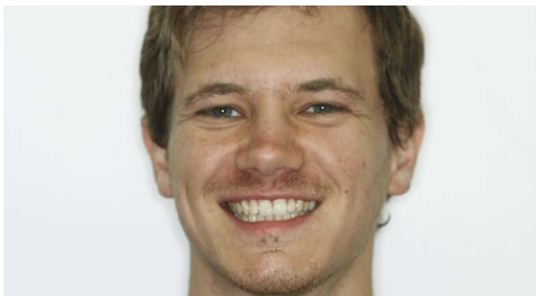
Figure 9: The postoperative portrait shows final restorations that are esthetic and functional.

opaque tint was cured and then a thin layer of the dentin shade was added to blend the opaque tint. A composite placement instrument (IPCL, Cosmedent) was used to smooth the transition of the composite interproximally and a #3 brush was used to smooth the entire dentin layer. The restoration was evaluated incisally at this point to ensure that the dentin layer was not too thick, allowing sufficient room for a thin enamel layer. Once the dentin layer was cured it was safe to remove the lingual matrix. The tape was also removed so that the last layer of composite could be pulled through interproximally with a clear mylar strip to create a smooth transition into the contact area. 13 The final enamel layer was placed (Renamel Microfill Light Incisal). The small particles in microfills are highly polishable, making them perfect enamel composites. A clear mylar strip was pulled through the contact area using the “mylar pull” technique. 14 The final enamel layer was then smoothed with the #3 brush prior to the final cure.