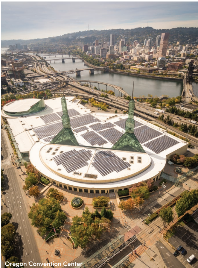
Oregon Convention Center

Michele will demonstrate training a variety of behaviors using specific reward strategies for each goal behavior. The results demonstrate just how powerful a well-applied reinforcement strategy can be. Behavior examples will include distance responses, challenging body poses, a variety of trick behaviors and care behaviors. Join Michele as she shares enlightening moments of discovery in the available power in the application of reward-location strategies.