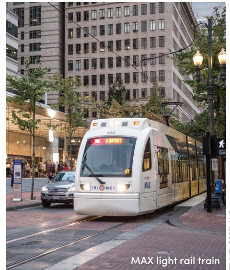
MAX light rail train

*Please note there is not a service fee for reservations booked and ticketed via our reservation 800-number.