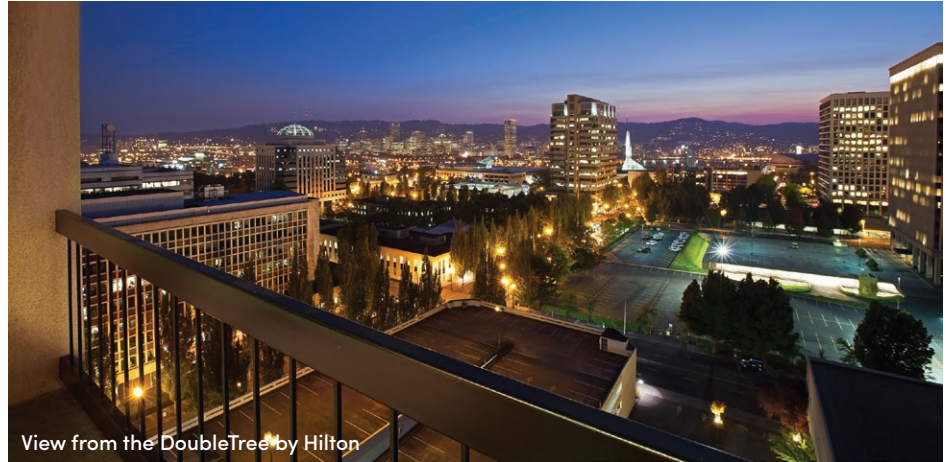
View from the DoubleTree by Hilton

A splendid location, relaxed respectability and an urban lifestyle that is unsurpassed for its livability make Portland a city to visit and remember.