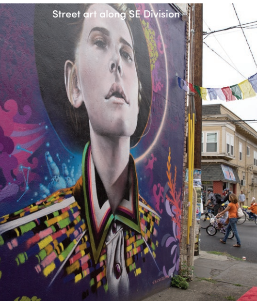
Street art along SE Division