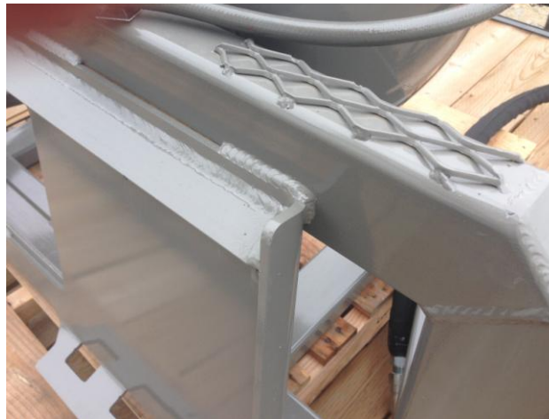
Superior welds on a stout frame

EarthBuster's™ pneumatic probe is pressed into the ground, and aided by a Sullair air hammer as needed to penetrate even compacted and rocky soils at depths up to 6 feet..