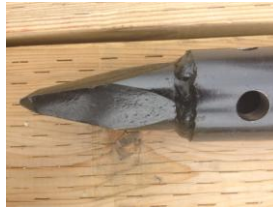
Pneumatic Probe Tip

EarthBuster's™ pneumatic probe is pressed into the ground, and aided by a Sullair air hammer as needed to penetrate even compacted and rocky soils at depths up to 6 feet..