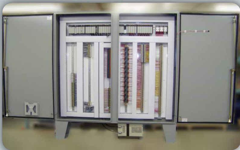
PLC controls systems