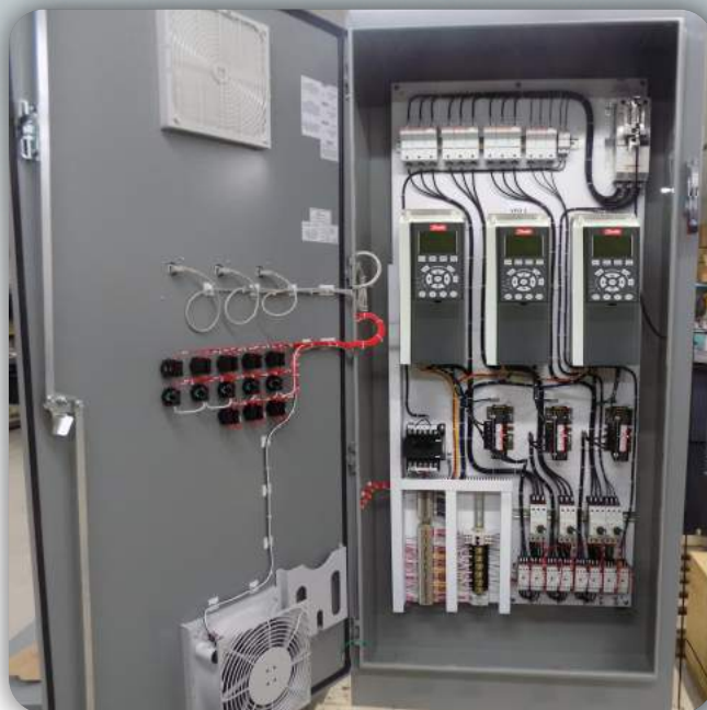
Variable frequency drives