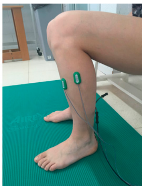
Figure 1. Surface electrode placement.

Prior to electrode placement, the skin was shaved, cleaned, and checked for impedance. Circular 20 × 20 mm pre-amplified bipolar surface electrodes (SX230, Biometrics Ltd. Gwent, UK) were used. With an inter-electrode distance of 20 mm, the electrodes were positioned parallel to the TA and PL muscle fibers following the guidelines for electrode placement (SENIAM recommendations) [33] (Figure 1).