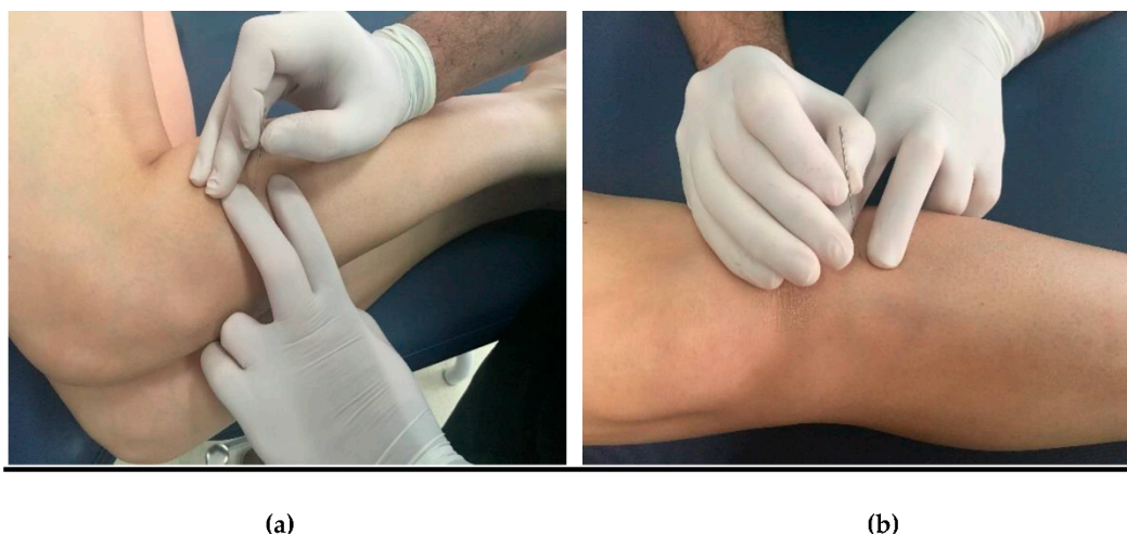
Figure 3. Dry needling of Peroneus Longus (PL) and Tibialis Anterior (TA). (a) for PL, the subject was placed in the lateral decubitus position on the non-assessed side with hips and knees flexed to 90 degrees. The physiotherapist remained in front of the patient and inserted the needle perpendicularly from lateral to medial. (b) for TA, the subject was placed in supine and the physiotherapist was positioned ipsilateral on the treatment side to guide the needle in an anterior-posterior and slightly medial direction towards the tibia.

physiotherapist located the most painful latent MTrPs of each muscle and used a needle, sized 0.25 \times 0.25 \times 50 mm (APS Agu-Punt), for needling (Hong technique) at a frequency of 1 Hz for 30 s (1 puncture per second) [35]. After the first twitch response was obtained, the needle moved vertically 2–3 mm at this frequency [28] (Figure 3). For the placebo group, the same procedure was carried out using placebo needles with the same needle size (Streitberger Placebo—Needle®, Asiamed, Pullach, Germany) that did not puncture the skin surface but provoked a needle stick feeling. The handle of these placebo needles was pushed over the needle as soon as it touched the skin, appearing as though the skin was being penetrated, even though it was not [36].