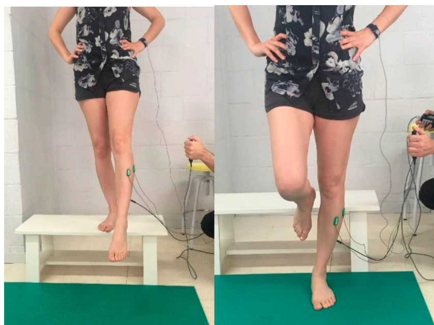
Figure 2. Landing maneuver.

The preparatory muscle activity (pre-activation) was computed using PC DATALOG Software version 8.51 (Biometrics Ltd., Gwent, UK) and the initial contact was defined as the first video frame in which the foot contacted the ground during the landing task.