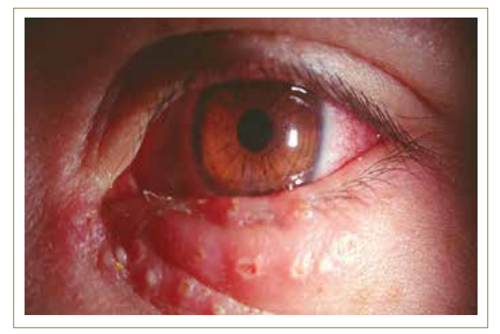
Figure 2. Herpes simplex viral blepharoconjunctivitis, with vesicles on the lid

In addition to adenovirus, other viruses have been implicated in viral conjunctivitis.<sup>18,19</sup> These include the picornaviruses, such as Enterovirus 70 and Coxsackie A24 ; the poxviruses, such as Molluscum contagiosum and Vaccinia ; and, in rare cases, HIV (human immunodeficiency virus), which can cause a primary conjunctivitis. The herpes simplex virus (HSV) can cause an isolated conjunctivitis, but this is very uncommon and tends to manifest as a blepharoconjunctivitis with vesicular lesions on the lids ( Figure 2 ) or as a dendritic keratitis. Also, HSV tends to be unilateral rather than bilateral in most cases.<sup>20</sup> The use of antiviral therapy for HSV conjunctivitis is controversial, but steroid therapy should be avoided.<sup>6</sup>