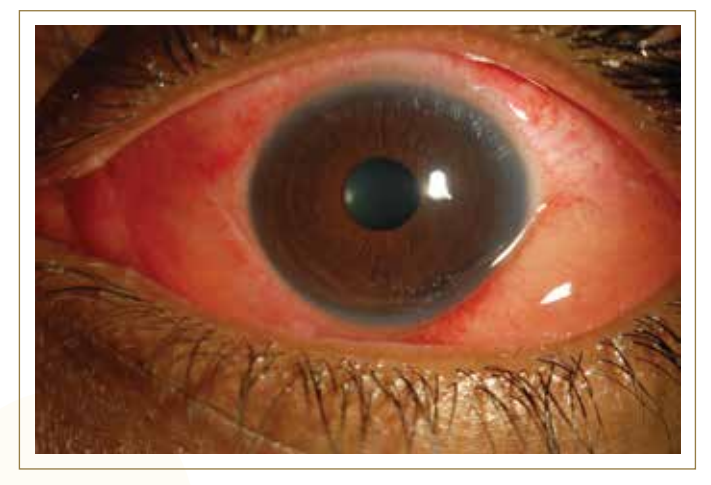
Figure 1. Whole-globe hyperemia seen in adenoviral infection

Dr Lonsberry: On slit-lamp examination, the presence of follicles is highly suggestive of a viral process. But before discussing the slit-lamp examination, several other important factors should be considered. The pattern of hyperemia can be helpful. Viral conjunctivitis tends to cause whole-globe hyperemia ( Figure 1 ), as opposed to focal hyperemia seen in many other causes of red eye.