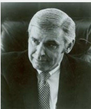
Leo Ryan Congressman, CA

Dam Failure to containment: 3 days, 100+ miles (Teton to American Falls)